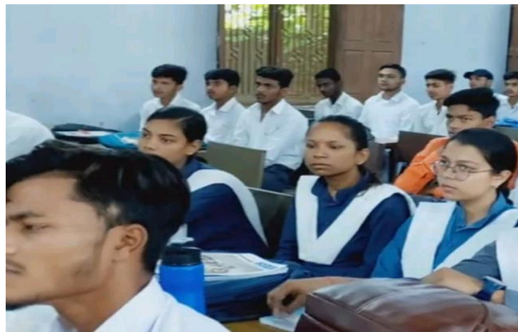
Glimps of the programme