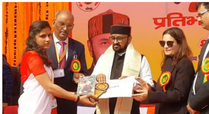
Higher Education Minister rewarding students