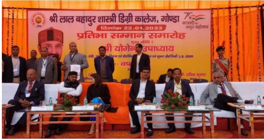
Guest present on the stage at the talent award ceremony