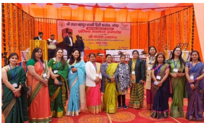
A Glimpse of the programme