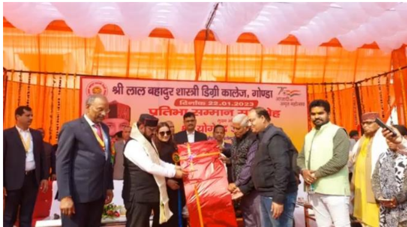
Education Minister Shri Yogendra Upadhyay honoured by Managing Committee, S.L.B.S.Degree College Gonda