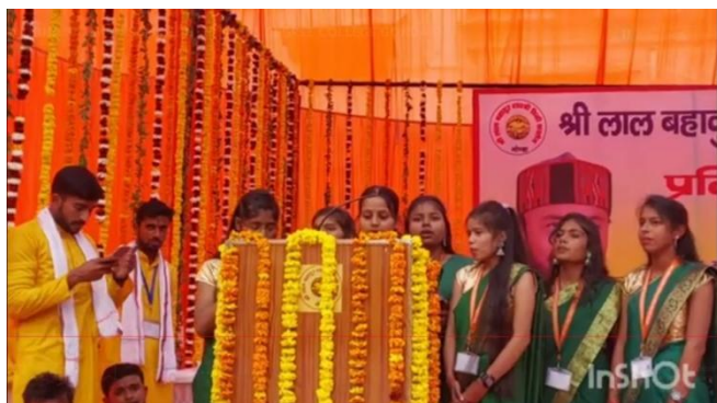
Students singing songs