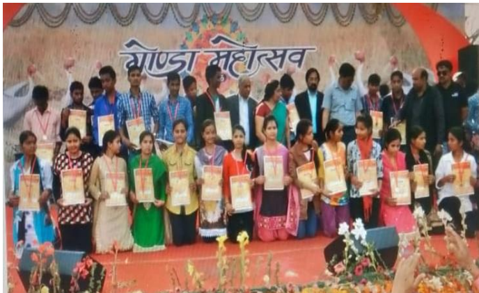
Winners from SLBSDC, Gonda