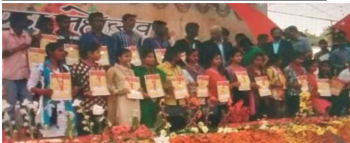
Winners from SLBSDC, Gonda