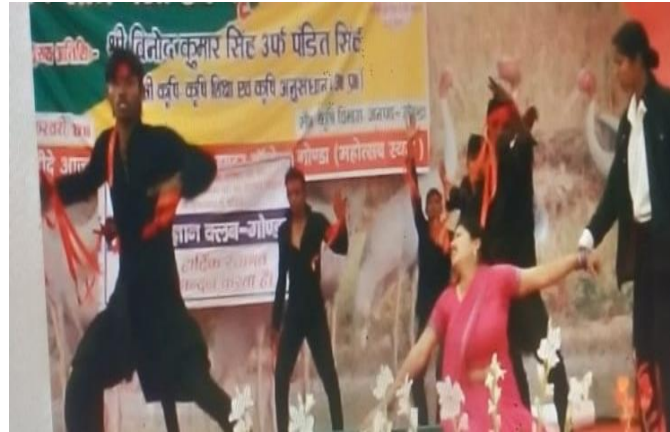
Play on Feticide