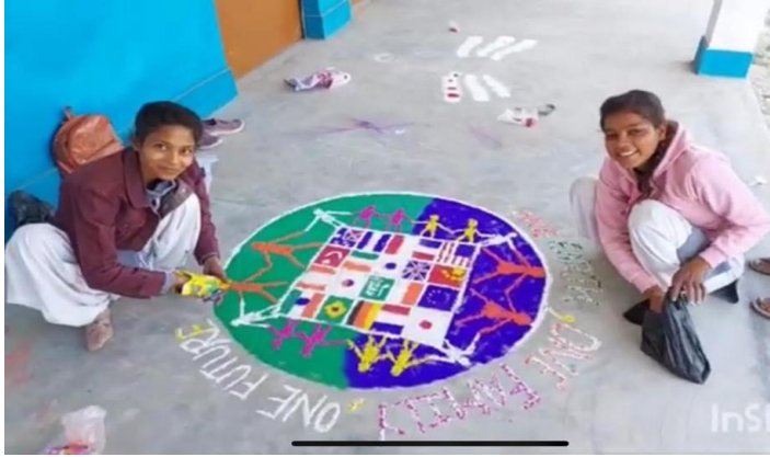
Glimpse of Rangoli