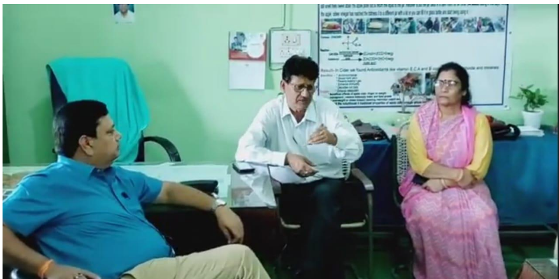
Self-reliant India campaign-steps from education to employment

Outcome : The symposium "स्वावलंबी भारत अभियान शिक्षा से रोजगार की ओर बढ़ते कदम" organized by the Botany Department of Sri Lal Bahadur Shastri Degree College, Gonda, served as a significant forum for exploring the critical nexus between education and employment in India's. quest for self-reliance. Through insightful discussions and collaborative endeavors, the symposium contributed to fostering a culture of innovation, entrepreneurship, and self-reliance among the youth, thereby laying the foundation for a prosperous and empowered nation.