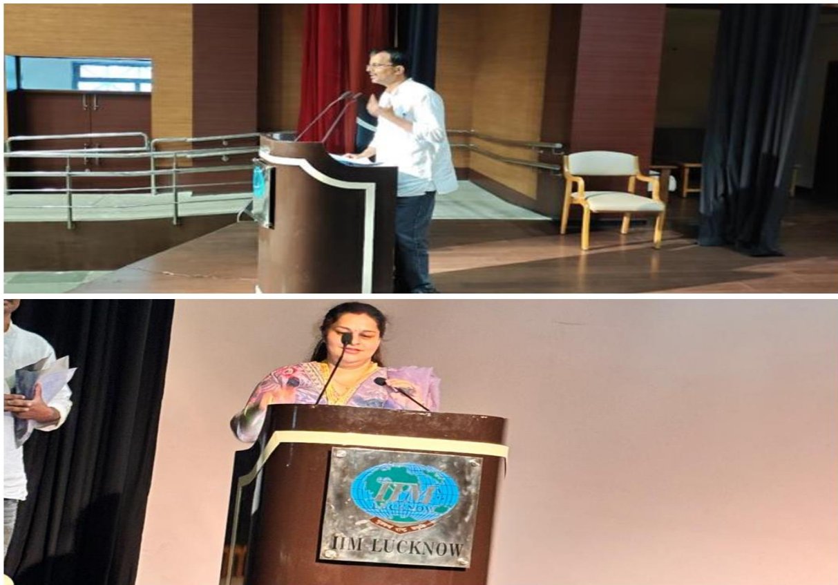
Pic10: VOTE OF THANKS