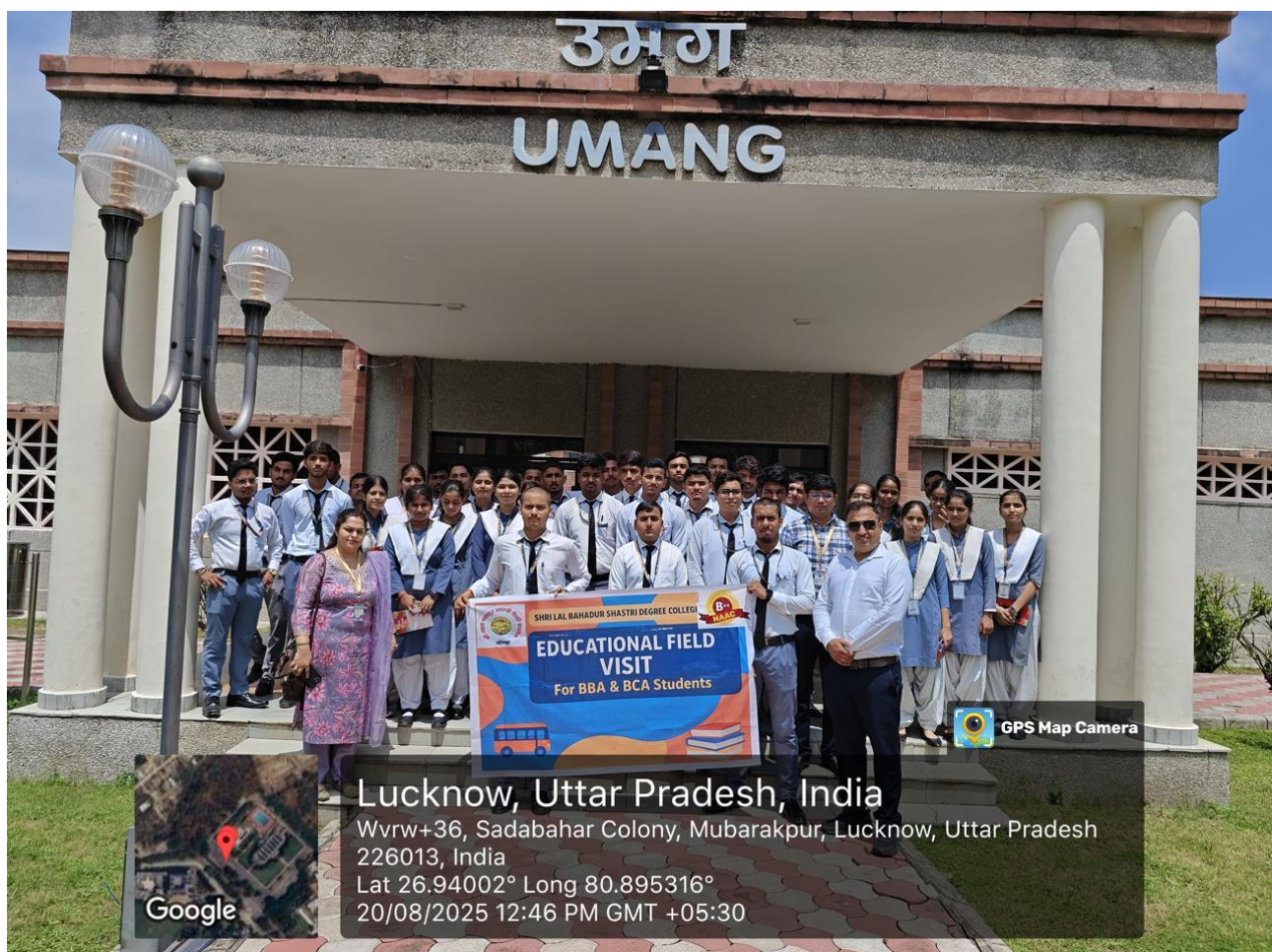
Pic1: FITNESS & RECREATION CENTER

This educational trip not only broadened the horizons of our students but also instilled in them a renewed sense of purpose, ambition, and responsibility towards shaping their careers and contributing to the progress of the nation.