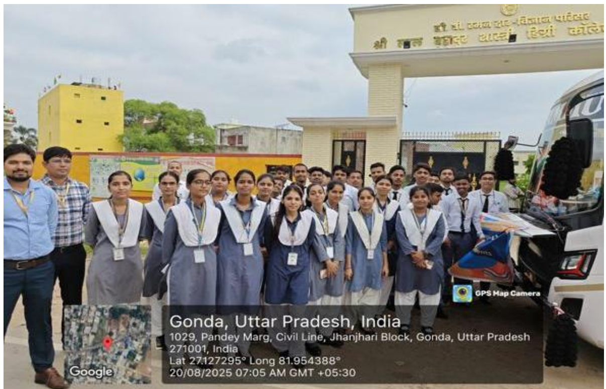
Pic7: Beginning of Trip