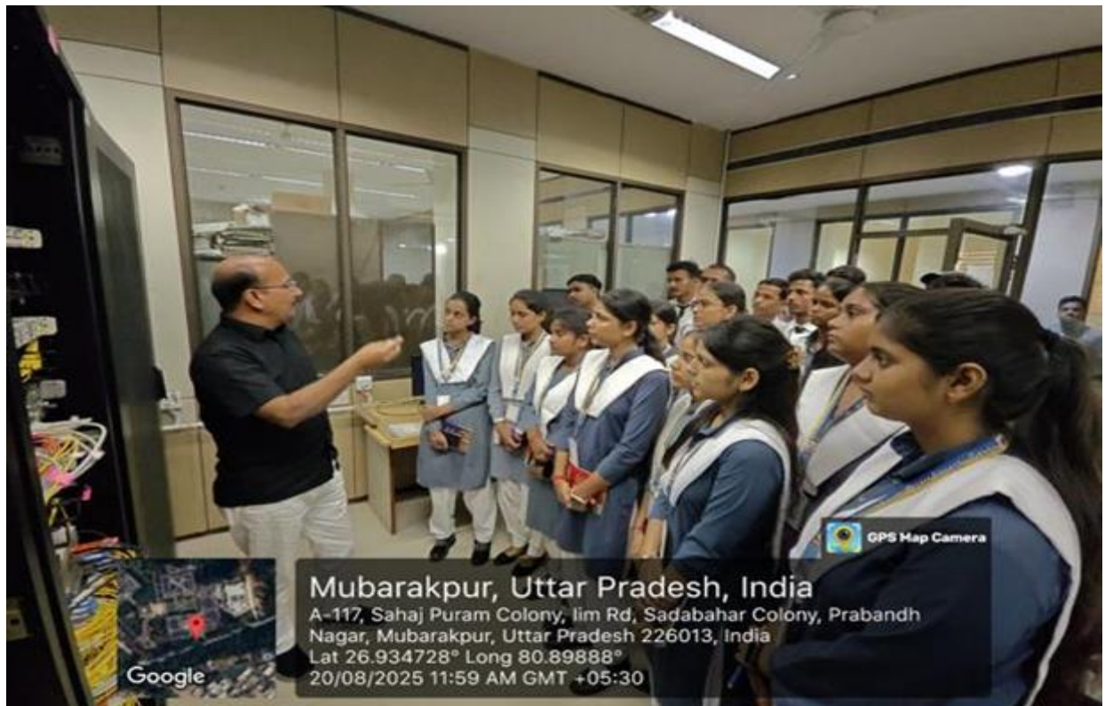
Pic9: SERVER ROOM