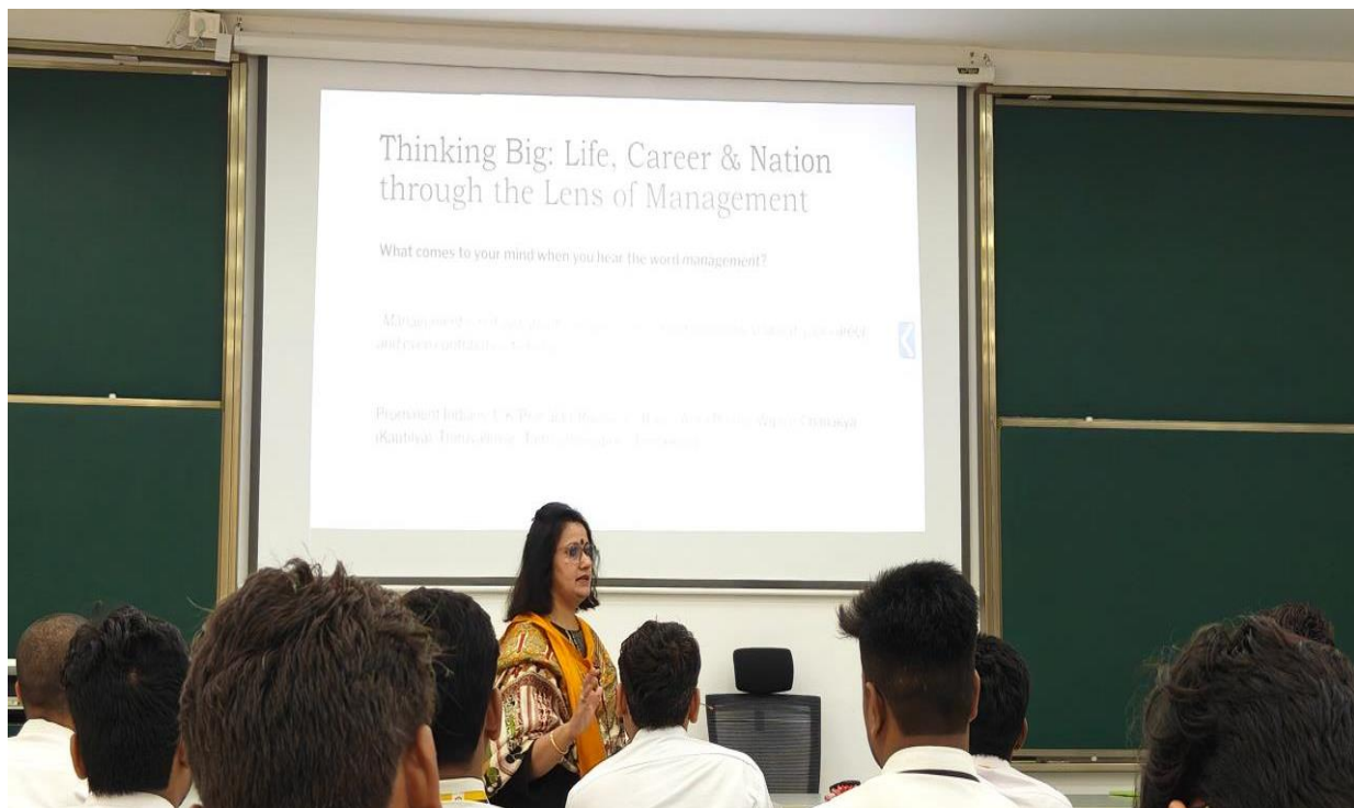
Pic5: LECTURE AND QUIZ